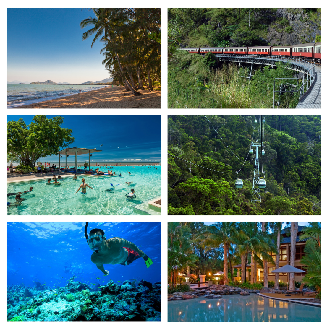
Figure 4: Cairns attractions and activities