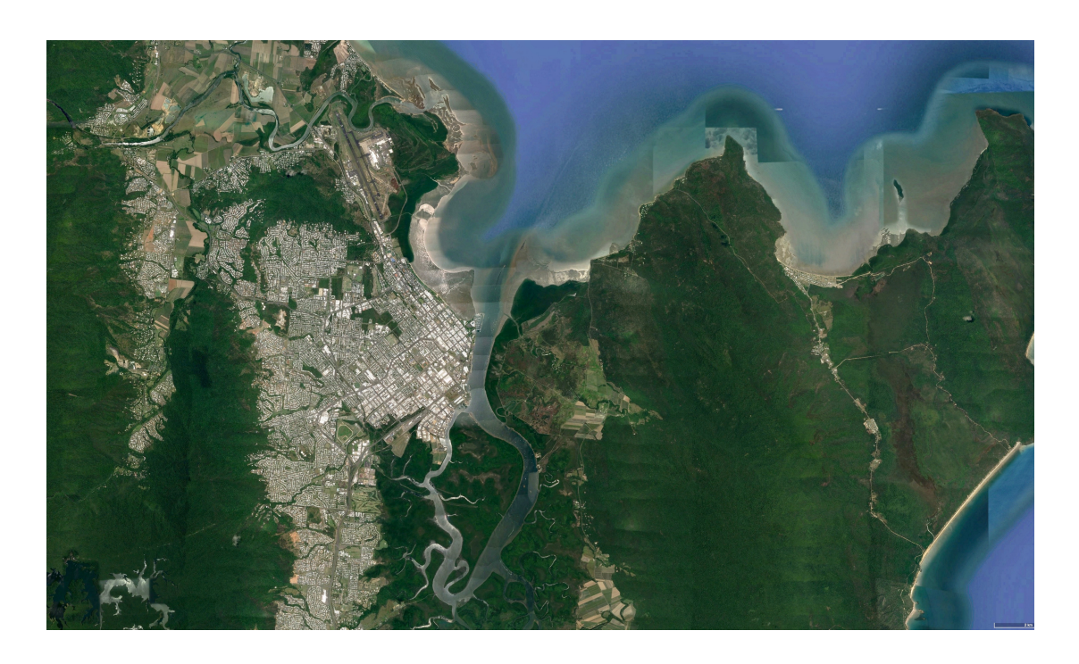
Figure 2: Cairns from above